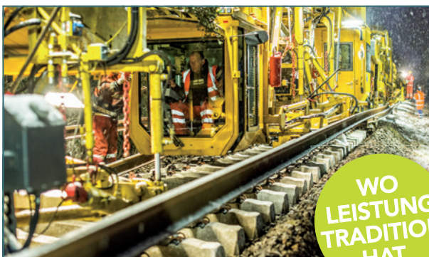
Gleisumbauzug P 100