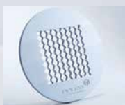
HeBoSint® Boron Nitride components.