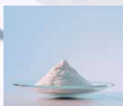
HeBoFill® Boron Nitride powder.