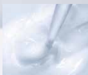
HeBoCoat® Boron Nitride coatings.