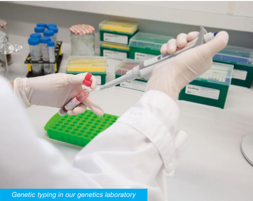
Genetic typing in our genetics laboratory