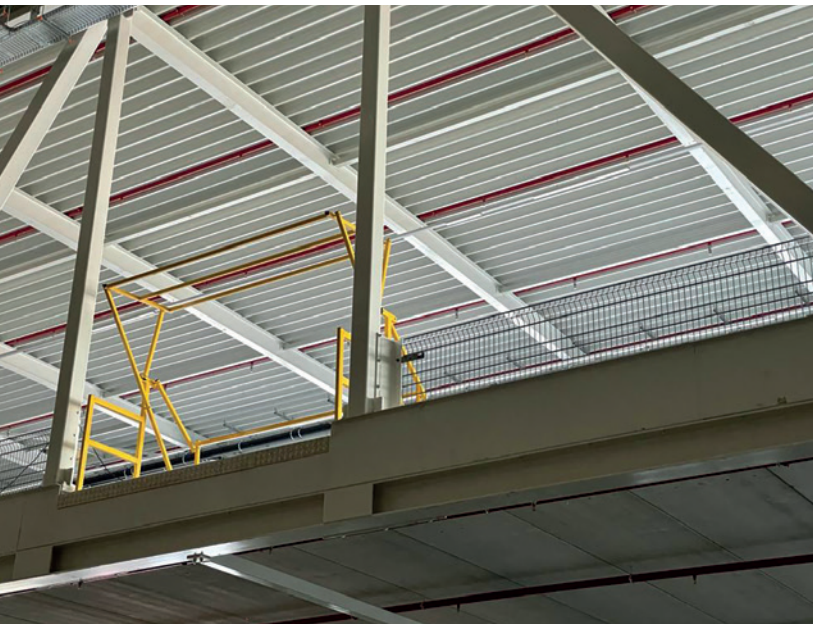
INTEGRA-pw 0.1 balustrade safety barrier, area of use: Mezzanine