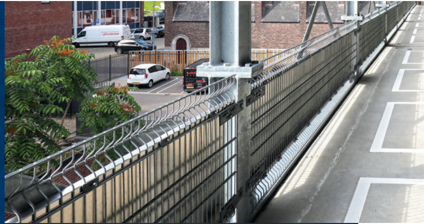
INTEGRA-pw Extra Glare shield smooth plate, nature

Surface: Untreated, powder coating optional