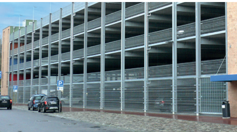
INTEGRA-pw Lock Ground floor