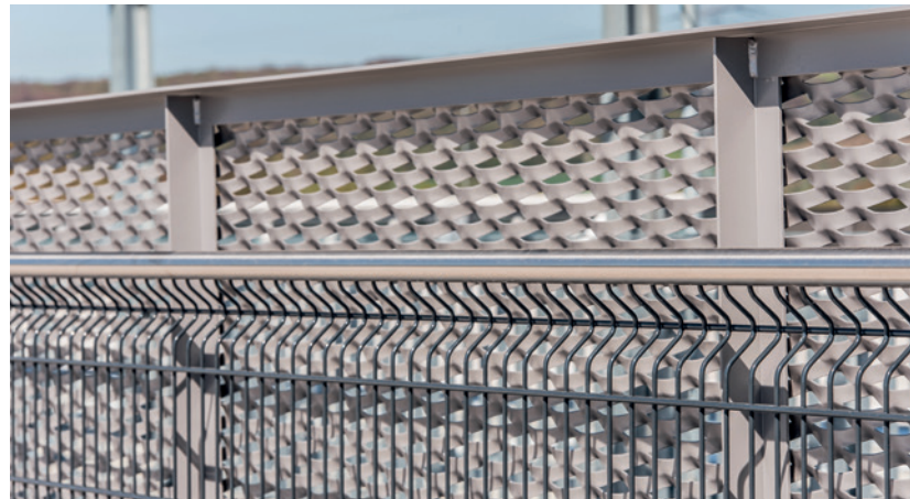
INTEGRA-pw Extra – Handrail stainless steel

BLECHZUSCHNITTE KANTPROFILE STANZEN LASERN SCHWEISSTECHNIK ÜBER 60 BLECHSORTEN IMMER VORRÄTTIG